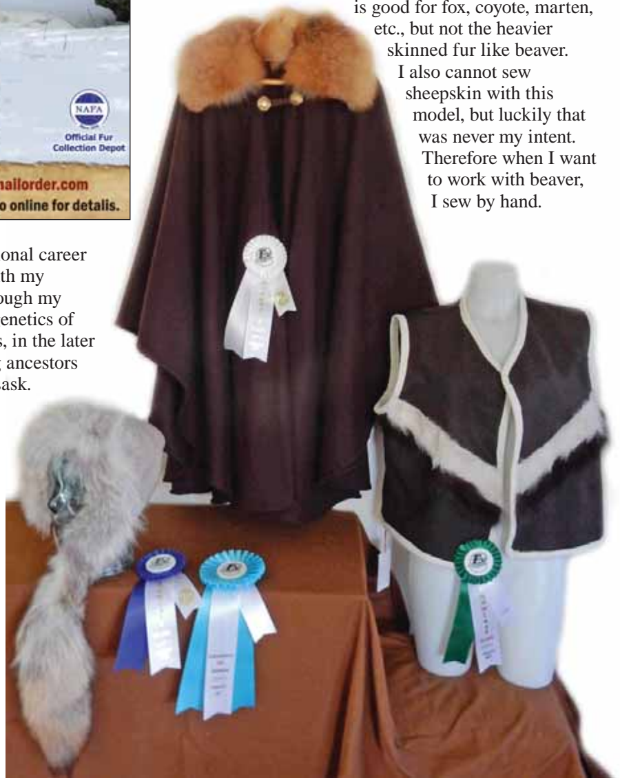
A coyote fur-trimmed women's hat, a red fox fur collar on a brown wool Melton cape, and a brown wool vest with chevron strips of badger and skunk that were entered in the Saskatchewan Art Showcase of the Saskatoon Exhibition, under the 2016 theme "Mother Earth."

I also cannot sew sheepskin with this model, but luckily that was never my intent. Therefore when I want to work with beaver, I sew by hand.