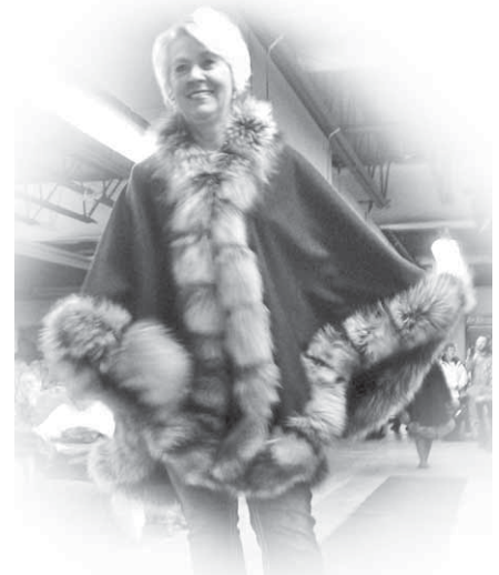
Fur fashion by New York Furs, Toronto.

The availability of other clothing trimmed with wild fur has been minimal for several years. However, in the last two to three years the fashion industry has begun to show wild fur accessories more and more. Coyote and fox collars, often huge collars, have appeared