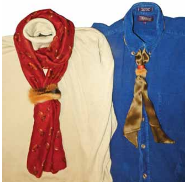
A red fox and leather slide that can be worn with large women's scarves and a coyote and leather tie slide worn with a silk Western tie that can be worn on a men's corduroy or denim shirt – each making a subtle "I believe in wearing fur" statement.

In closing, I encourage more trappers to wear fur when they go to town, to meetings, or work booths about fur trapping. Promotion is often visual and if we want more